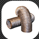
FD3 3" Flexi Ducting