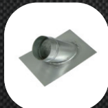
FR3 3" Angle Flange Flat