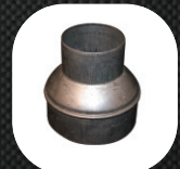
F5R3 5" to 3" Reducer