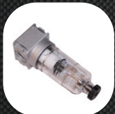
786 - Air, Dirt & Water trap 783 - Nipple