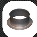
FF3 3" Flange Flat