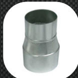
F6R5 6" to 5" Reducer