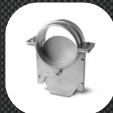
Gate Valve 803