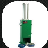
Paint Can Crusher