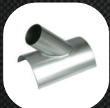
FRA3 3" Angle Flange